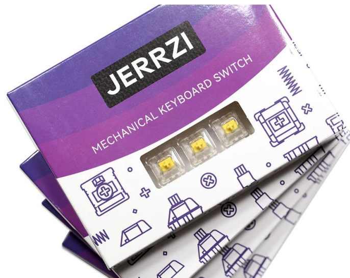
Figure 5: Jerrzi OEM switch packaging as seen on KBDFans.

Of all of the new manufacturers on this list, Jerrzi is far and away the most productive and longest overdue of formal recognition on my behalf. Established in mid-2021 and showing up in the form of ‘JERRZI’ branded OEM style switch releases in early 2022, Jerrzi has gone on to produce over two dozen different switches in the year and change following this. In addition to a slew of Jerrzi-branded releases which have been graciously shuttled to me by my sponsor SwitchOddities, known collaborations between Jerrzi and existing brands have appeared in the form of a series of several RK switches, a pair of ‘Qeeke’ branded switches, and even a one-off collaboration with up and coming switch designer XCJZ which I covered in my XCJZ Jerrzi Lotus Stem Switch Review. In addition to an official website for Jerrzi, which formally names them as “Huizhou Jiuzi Electronic Technology Co. LTD”, several western and western-facing vendors have had extensive contact with their sales team to the point of me feeling confident that this is in fact a separate production facility from other established brands. Interestingly, though, it is rumored that the molds used in the production of switches at Jerrzi may be coming from a mold production house that is currently or was at one point used by Huano.