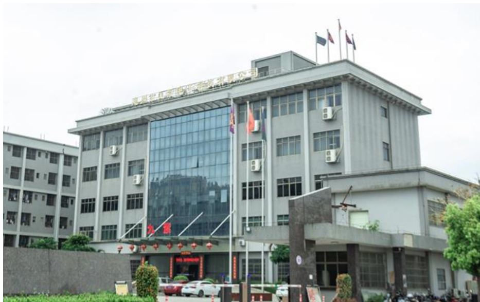
Figure 6: Picture of Jerrzi production facility from the front page of their website.

Of all of the new manufacturers on this list, Jerrzi is far and away the most productive and longest overdue of formal recognition on my behalf. Established in mid-2021 and showing up in the form of ‘JERRZI’ branded OEM style switch releases in early 2022, Jerrzi has gone on to produce over two dozen different switches in the year and change following this. In addition to a slew of Jerrzi-branded releases which have been graciously shuttled to me by my sponsor SwitchOddities, known collaborations between Jerrzi and existing brands have appeared in the form of a series of several RK switches, a pair of ‘Qeeke’ branded switches, and even a one-off collaboration with up and coming switch designer XCJZ which I covered in my XCJZ Jerrzi Lotus Stem Switch Review. In addition to an official website for Jerrzi, which formally names them as “Huizhou Jiuzi Electronic Technology Co. LTD”, several western and western-facing vendors have had extensive contact with their sales team to the point of me feeling confident that this is in fact a separate production facility from other established brands. Interestingly, though, it is rumored that the molds used in the production of switches at Jerrzi may be coming from a mold production house that is currently or was at one point used by Huano.