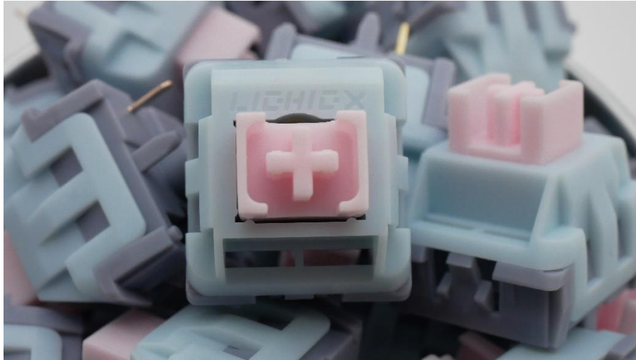
Figure 3: LICHICX Lucy silent linear switches displaying the stylized 'LICHICX' nameplate indicative of this manufacturer.