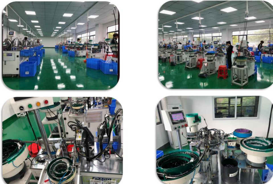
Figure 2: Photos of Grain Gold's switch assembly room and some associated machinery for such.

Fully and formally known as “Dongguan Grain Gold Electronic Technology Co. LTD”, Grain Gold is a fairly new switch production facility first appearing to western facing switch collectors in late Q2 to early Q3 of 2022. While my earliest contact with them came by way of some of their collaborations with NextTime in the form of the Blue Star, Engine V3, Bamboo Shoot, and Watermelon Pro switches which you may have seen previously on AliExpress or Taobao, it was in July of 2022 that I received a marketing pamphlet directly from a sales contact at Grain Gold that outlined a lot more than just these switch collaborations. Obviously being a touch on the vague side, this document not only suggests that Grain Gold has significantly more broad connections with technology and computer companies around the world, but directly provides photographic evidence of a production facility as well as some switches which I have yet to see for sale anywhere else in the world. Using this document as well as further contact with the sales individuals directly, it's been positively identified by myself and other collectors that the recent CIY Evo and G-Square switches have been produced by Grain Gold, in addition to the NextTime brand which has had a few further releases beyond those mentioned above.