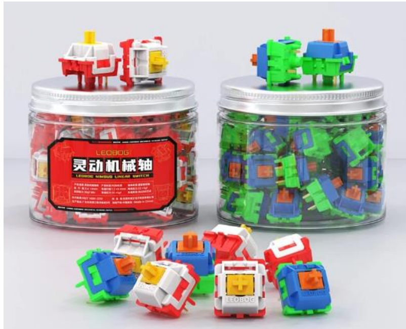
Figure 7: Leobog Nimbus (Red/White) and Juggle (Blue/Green) original marketing render with accurate to real life packaging.

While there is a chance that you may have encountered at least a couple of the names on this new manufacturer list if you're a bit deeper into the newer mechanical keyboard hobby than most, I can say with pretty strong confidence that most people have not heard of SOAI by that name. SOAI, which is short for "Dongguan Suoai Electronics Co. LTD", is a general computer peripherals manufacturing facility which was established a very long time ago and only recently has begun producing mechanical keyboard switches in house. As per their rather extensive Alibaba page which details more than sufficient proof of their existence which is cross-verifiable, SOAI's largest brand of switches is that of 'Leobog'. Carrying funky names and strange colorways, over a dozen different Leobog switches have been released since the debut of the Nimbus and Juggle switches in November of 2021. While there is a good chance that other branded switches have been produced by SOAI over the course of the past few years in parallel with their Leobog releases, such as some of the winglatch Mengmoda branded switches, collectors are still on the lookout for where those may be. There is a strong possibility that AULA branded switches exist somewhere in the prebuilt keyboards being offered by SOAI on their Alibaba sales page, though no confirmation of such has been had quite yet.