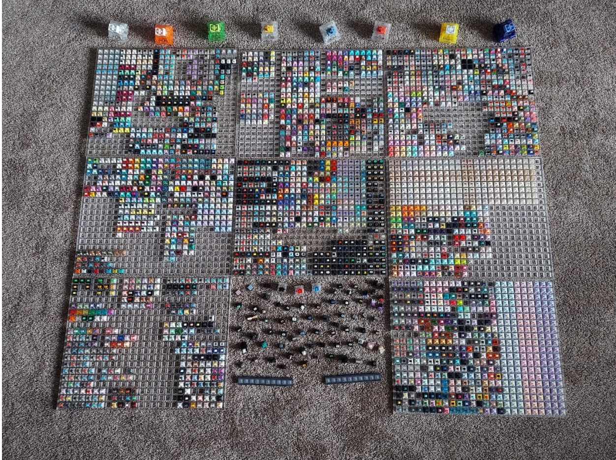
Figure 4: Family photo as of 3/11/24 with 2,792 unique, different keyboard switches.