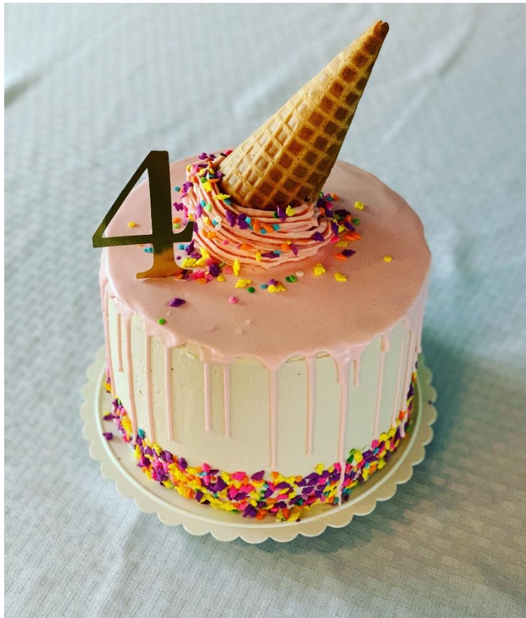
Figure 1: Something about the ice cream cone really stood out to me on this one.

And just like that we are back here again after another entire year of writing switch reviews and working on all manner of content for this website. That's right, the website is officially four years old as of today, making it more tenured than a sizable chunk of the keyboard community that joined during the peak of and in the years following the COVID-19 pandemic. In parallel to the website's continued growth and expansion, I too have had quite a year establishing my life as a full time working adult. In spite of the fact that I've moved around and changed employment less over the last year than nearly any year in my life previously, life around me never seems to slow down and I'm not sure at this point if it ever will. Throughout all of these changes, the website and the switches have always been here with me and have long since been one of my creative outlets in trying times. While I have said many a time before in the past that I would continue to work on all of this without any of you here to read it, know that your continued readership, support, and love over the past few years have been one of the biggest reasons I've maintained the pace of all of this around my otherwise chaotic life. As is tradition, let's go ahead and bring out some cake to celebrate making it to this milestone!